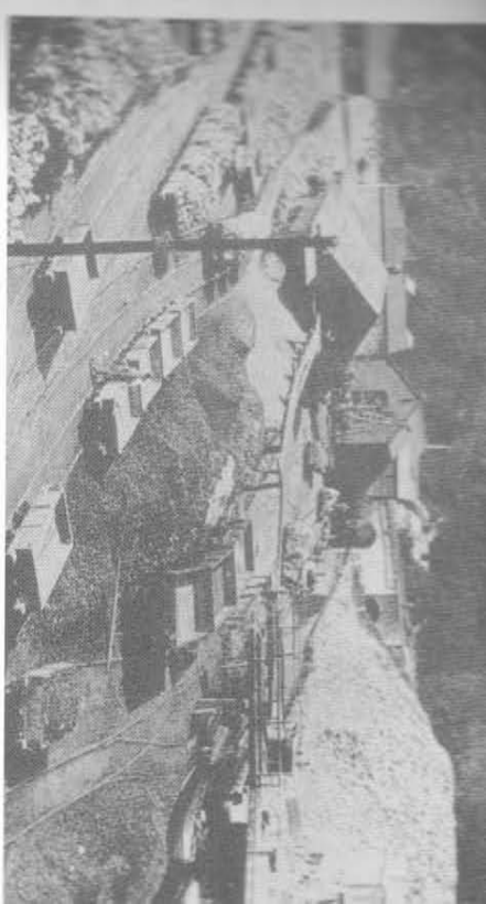
The Wharf at Froghall